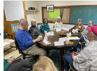
Table Talk: In March the SV Events Committee started Table Talk , which will meet sporadically to discuss topics that our Members have recommended. (You'll see some examples of Table Talks on March 24, March 31, April 21, and May 12.) The photo is of a March 17 Table Talk.

Neighbors: The byline of Seaglass Village is Neighbors Helping Neighbors to Age in Place . Another aspect of neighborliness for our newsletter readers is to tell your neighbors about SV.